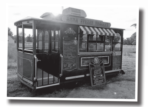
Anna Street Trolley provided ice cream for the ice cream social.

help fund an ice-cream social at Annie Jeffrey with ice cream from Anna Street Trolley. This event was to help celebrate hospital week for employees and the community.