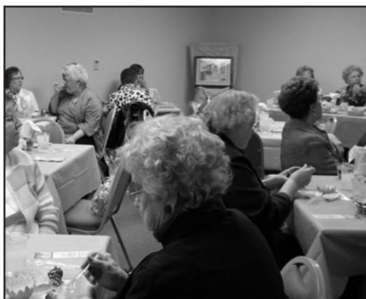
The Annie Jeffrey Volunteers enjoyed a delicious brunch and program at Annie Jeffrey Health Center in April for Volunteer Appreciation Week.