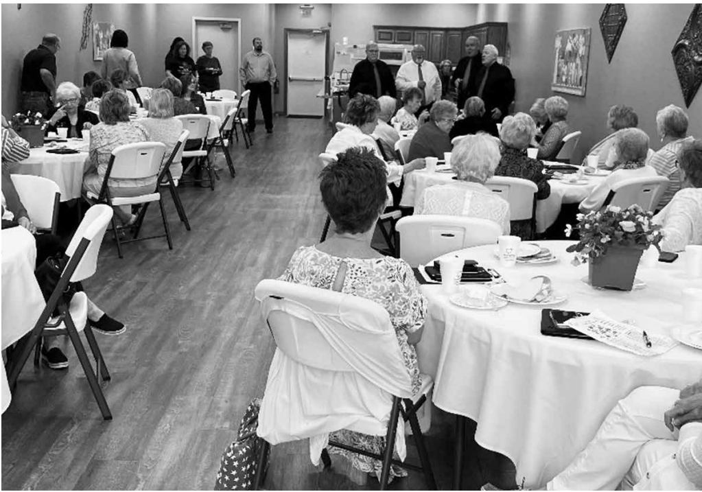
Annie Jeffrey Health Center honored Volunteers with a brunch and a program.