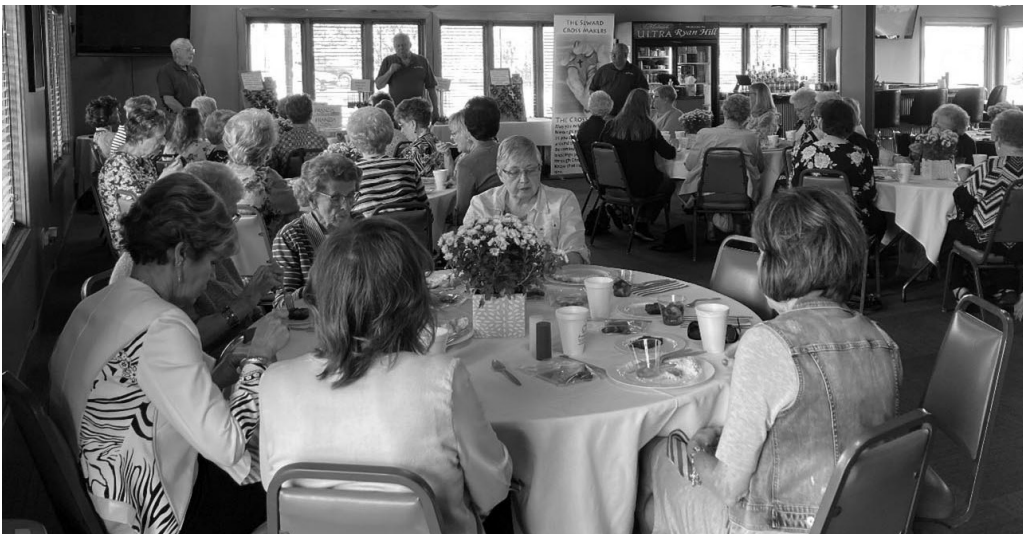
Annie Jeffrey Health Center honored Volunteers with a brunch and a program.