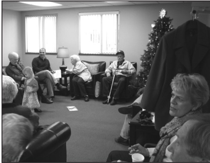
Newly remodeled Annie Jeffrey Family Medicine Clinic waiting room at Open House