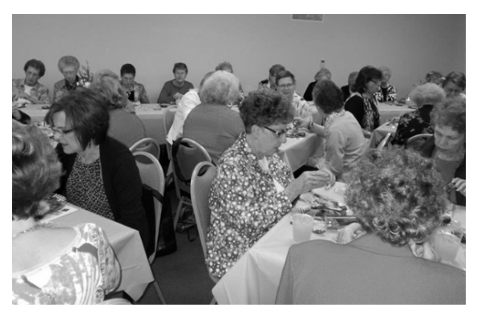
Annie Jeffrey Health Center honored Volunteers with a brunch and a program.